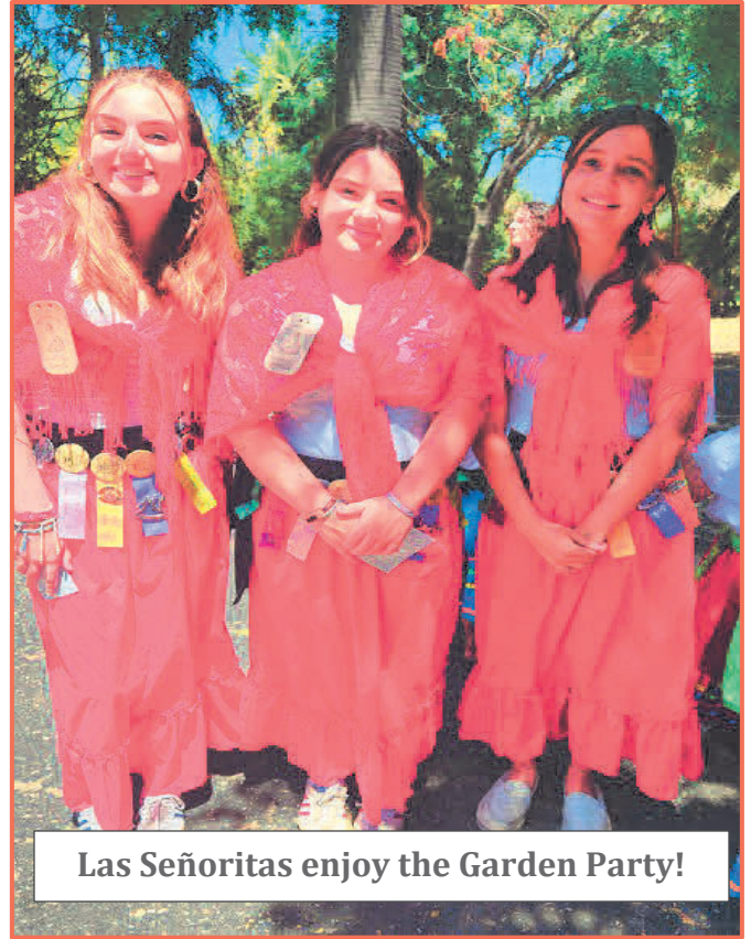
Las Señoritas enjoy the Garden Party!