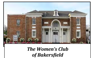
The Women's Club of Bakersfield

All Committee Members must participate to enhance and improve the Order! Thank you!