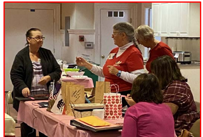
Drawing names for lucky prize winners!