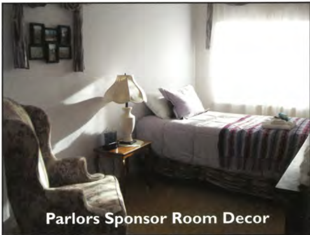
Parlors Sponsor Room Decor