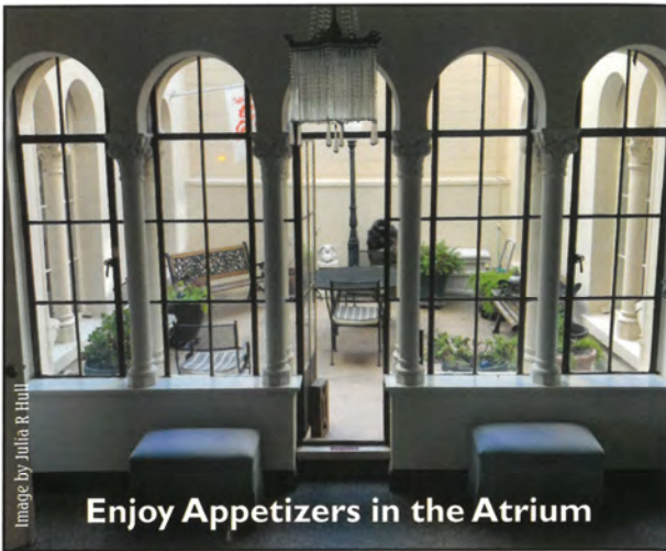
Enjoy Appetizers in the Atrium