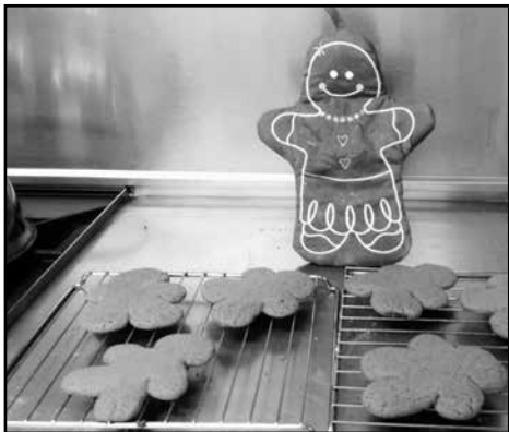
Home guest Jeanette Bemis baked gingerbread cookies during a visit when the heater in the Home wasn't working. Not only were the kitchen and dining room warm, but the house smelled great!