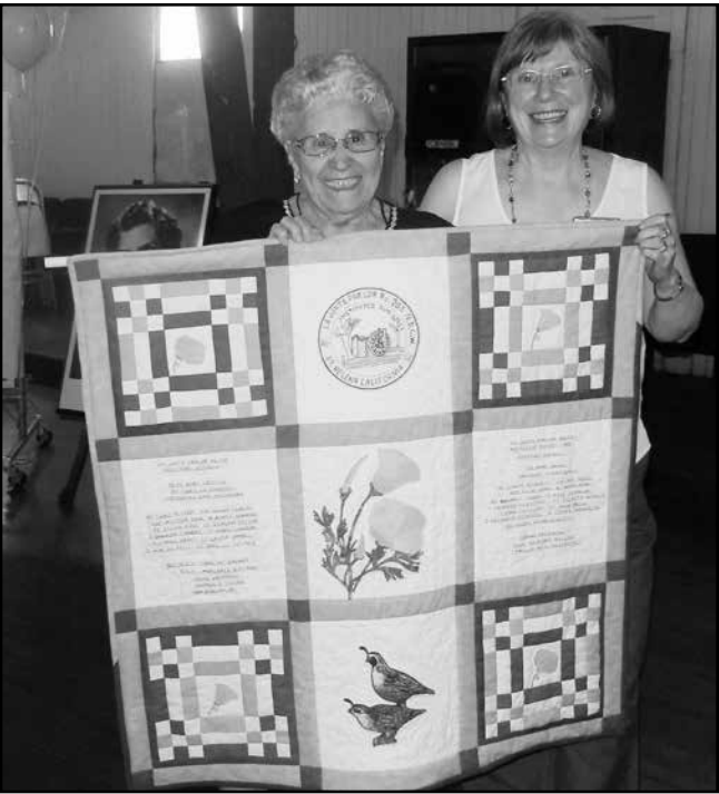
La Junta Parlor No. 203 celebrated its 100th Birthday on August 10, 2013 with a luncheon and fund raiser for the Pathway Home at the Veterans Home in Yountville. La Junta would like to thank those that worked so hard to make this celebration a success. We also would like to thank all our sisters from other Parlors who made the trip to St. Helena to take part in our festivities and all those that sent their good wishes. We had almost 100 people who traveled from all over the state in attendance. We are extremely proud that many of our Grand Officers were able to attend.