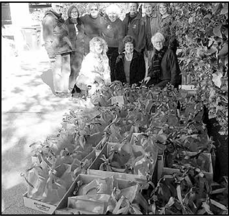
Santa Cruz Parlor Members gathered on December 11th to pack 300 gift bags for veterans.