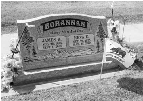
Right: Remembering one of our beloved Native Daughters.

In honor of Admission Day, South Butte Parlor No. 226 placed the California Flag on the gravesites of their sisters at Sutter Cemetery in Sutter, California.