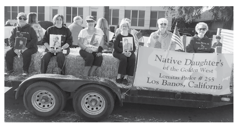
Pictured are members of Lomitas Parlor in the Veterans Day Parade in Los Banos.