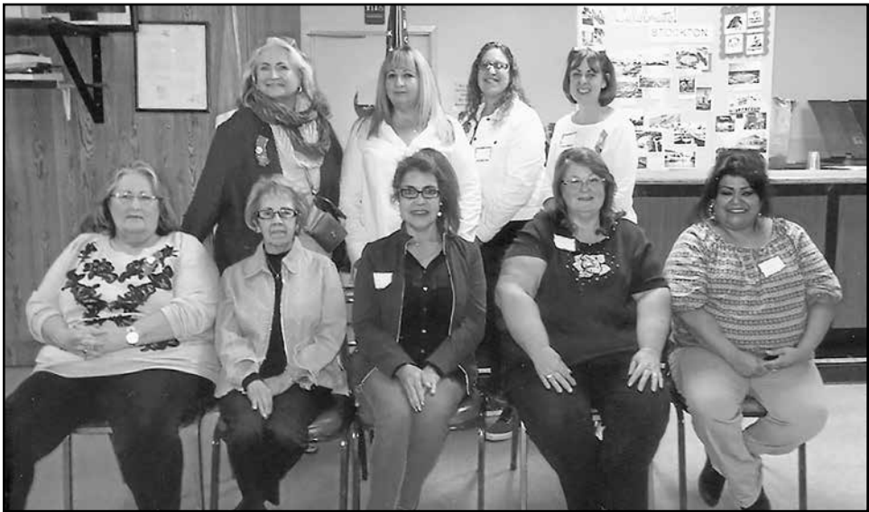
Welcome to the November initiates of Joaquin Parlor.