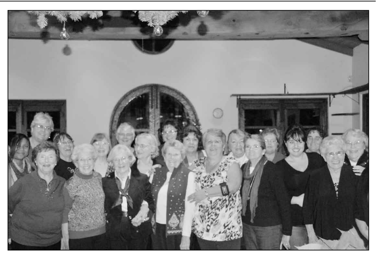
Twenty-one ladies attended the dinner and festivities as La Junta Parlor No. 203 celebrated Christmas, and collected food for the St. Helena Food Pantry.

The dinner was thoroughly enjoyed by all, to the extent that it was decided we would go to the same restaurant again next year. At the end of the evening we all went our separate ways but feeling happy that we had a great dinner and enjoyed the evening with great friends. La Junta Parlor hopes that everyone has a safe and happy holiday season. We want to wish all a Happy New Year.