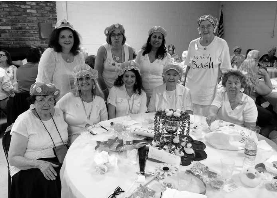
Clearly Grace Parlor members who attended the Gold Dust Girls Dinner at Grand Parlor 2016 had a fun time! Quack, quack, quack!