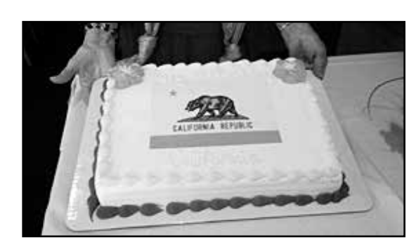
El Tejon Parlor No. 239 celebrated California Admission Day with a luncheon, September 6, 2013. opening), color: Black. If you need informa-

The seal has been changed many times by people who felt they could take liberties with the figures and products on the seal. The government no longer allows such liberty