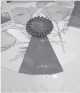
2nd Place Ribbon