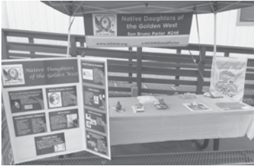
NDGW information set-up at San Bruno Parlor's Blood Drive on August 22, 2021.