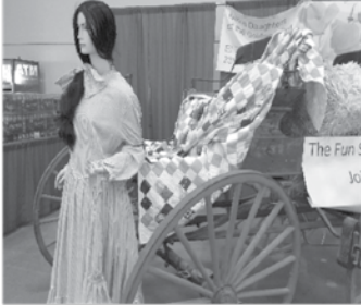
Buckboard and Mannequin