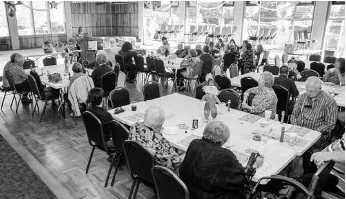
Bingo enthusiasts join in the fun at Aleli Parlor's Bingo Fundraiser on November 1, 2015.