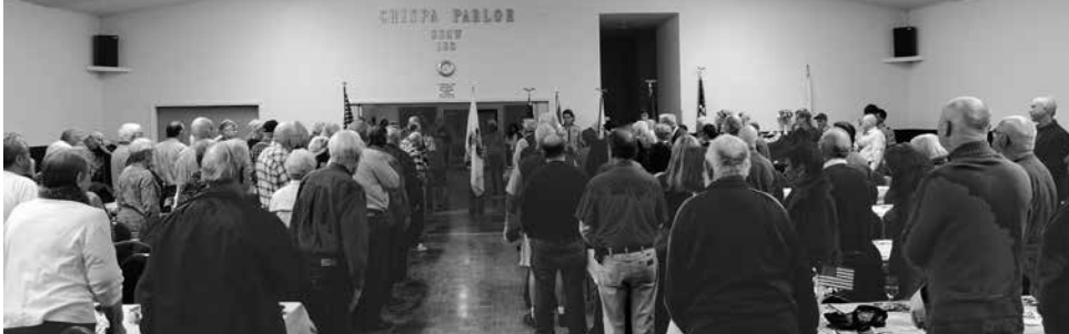
Flag salute at NDGW Ruby Parlor No. 46 Veterans Dinner, November 11, 2015.