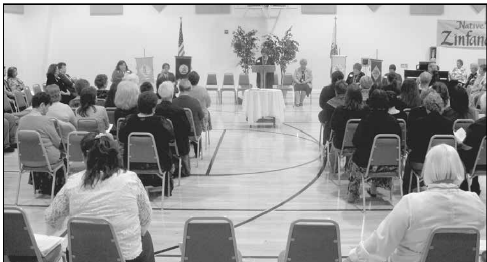
Twenty-eight Charter Members were initiated during Institution Ceremonies for Zinfandel Parlor No. 337 on February 24, 2014, at the Vinewood Church in Lodi.