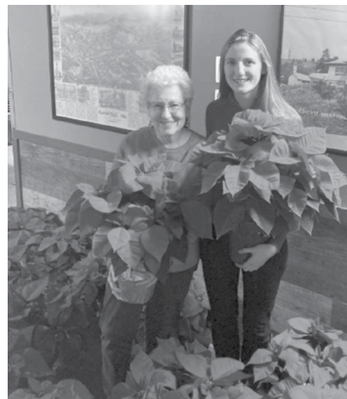
The poinsettias we donated to the Placerville Meals on Wheels program for meal recipients