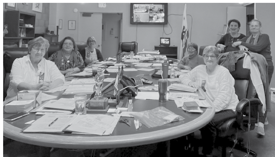
CF Committee Meeting inPerson & Zoom .